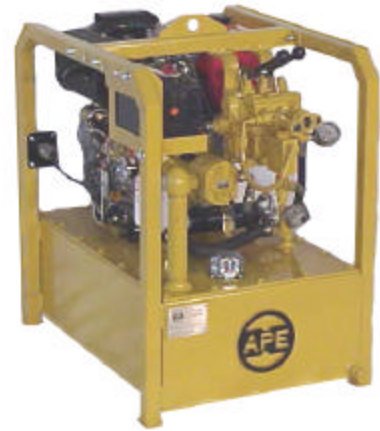
Model 14 power unit: gas or diesel, hand or remote pendant