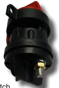
Switch Battery disconnect